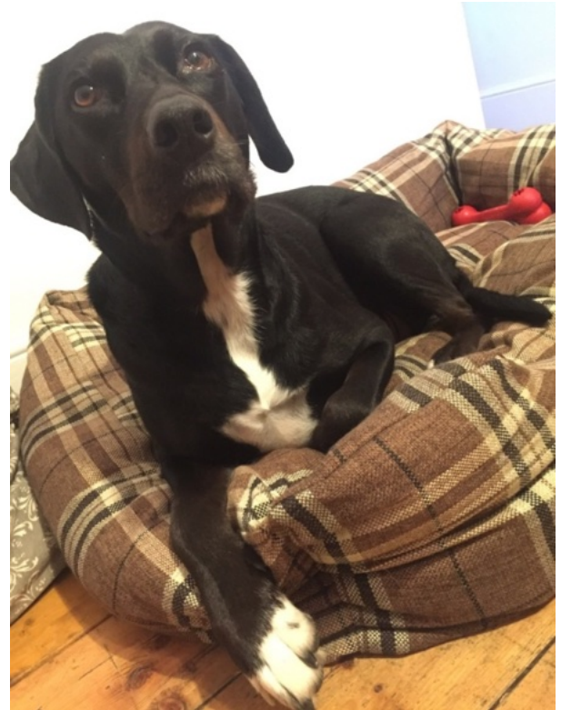
'Molly' a rescue dog