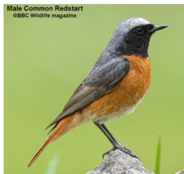
Male Common Redstart

https://butterfly-conservation.org/butterflies/purple-emperor .