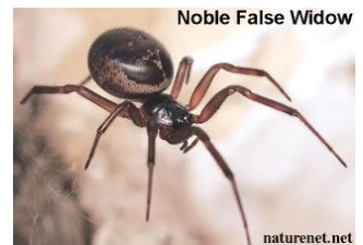
Noble False Widow

These can – extremely reluctantly – deliver a mildly venomous bite which feels like a wasp's sting. Usually, the animal has been trapped against skin and fears for its life. S. nobilis is Madeiran, so likes warmth. A friend of mine was bitten rolling over onto one in bed, but that's very rare. Learn more at www.nhm.ac.uk/discover/how-dangerous-are-false-widow-spiders.html